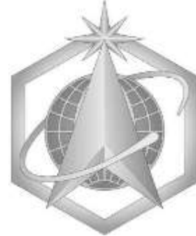
Figure 3.1. CSO Ornamental Cap Ribbon.