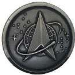
Figure 3.4. Service Coat Button.

3.1.6. Name Tag. The Space Force hexagonal name tag is authorized upon availability from AAFES, MCSS, or Individual Issue. (T-1). The name tag is interchangeable on the Class A service dress and the Class B uniforms. Configuration guidance remains unchanged and may be found in DAFI 36-2903. See Figure 3.5.