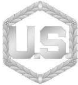
CMSSF U.S. collar insignia