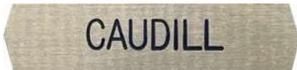
Figure 3.5. Nametag.

3.1.6. Name Tag. The Space Force hexagonal name tag is authorized upon availability from AAFES, MCSS, or Individual Issue. (T-1). The name tag is interchangeable on the Class A service dress and the Class B uniforms. Configuration guidance remains unchanged and may be found in DAFI 36-2903. See Figure 3.5.