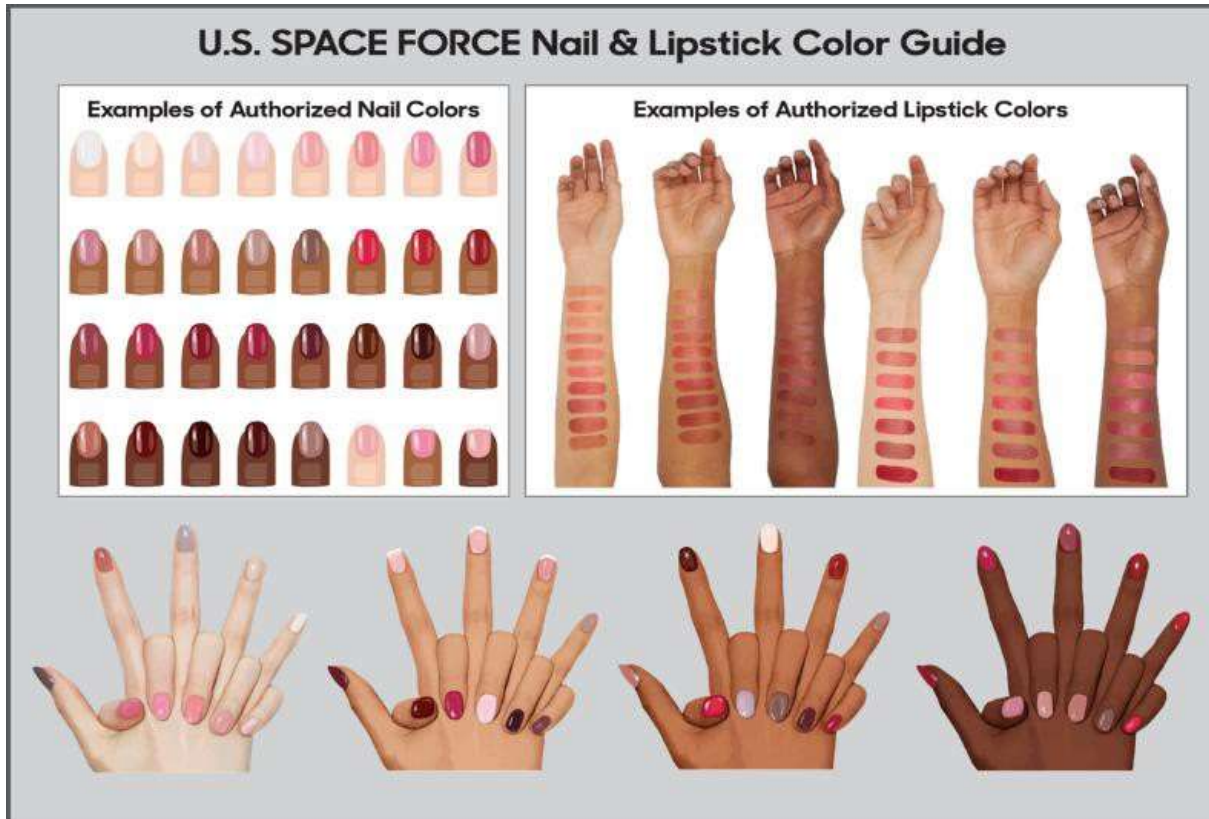
Figure 6.2. Nail and Lipstick Color Guide.

6.1.4. Lipstick. Male Guardians are not authorized to wear lipstick. Female Guardians may wear any shade of lipstick except extreme colors that include, but not limited to gold, blue, black, and fluorescent colors. Refer to Figure 7.2. for examples (not all-inclusive) of lipstick colors. Lipstick will complement the uniform. If there is any doubt as to whether a particular color of lipstick complies with the requirements of this paragraph, the affected Guardian's commander will make the final decision.