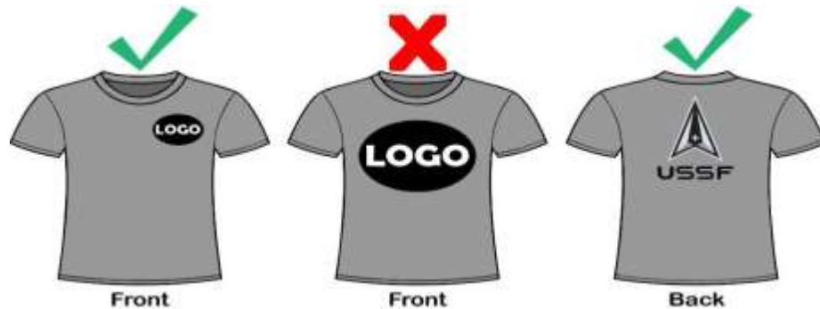
Figure 4.1. Short Sleeved Shirt.

4.1.3. Optional Long-Sleeved Shirt. If a long-sleeved shirt is worn over or in place of the short sleeved shirt, it must be gray in color and may have one small visible trademark logo. The shirt may not have multiple colors or patterns. Guardians may wear a gray shirt with the approved Space Force logo. The back of the shirt must be blank unless it displays the Space Force delta, logo, or is approved by squadron commander or equivalent. See Figure 4.2.