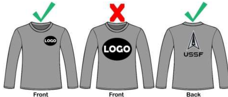
Figure 4.2. Long-Sleeved Shirt.

4.1.4. Sweatshirt. If a sweatshirt is worn over the short or long-sleeved shirt, it must be gray in color and may have one small visible trademark logo. The shirt may not have multiple colors or patterns. Guardians may wear a gray shirt with the approved Space Force logo. The back of the shirt must be blank unless it displays the Space Force delta, logo, or is approved by squadron commander or equivalent. ( Note: Guardians in training status are authorized to wear gray or black sweatshirts at the direction of the training unit's squadron commander or equivalent until the official Space Force sweatshirt is available at the training location). See Figure 4.3.