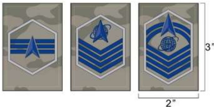
Figure 2.1. Enlisted Rank (OCP rank insignia).

2.1.3.4. Nametape and Space Force tapes are mandatory for all personnel and will be Space Blue embroidery on the three-color OCP background. (T-1) .