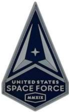
PVC Space Force Patch