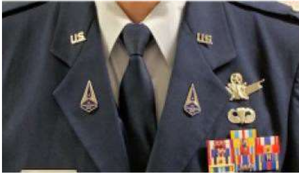
Figure 3.6. Distinguished Lapel Insignia on Service Dress Uniform.

3.1.8.3. The Space Force Distinguished Lapel Insignia is mandatory on the Mess Dress coat. The Lapel Insignia should be worn on the wearer's right and ½ inch above all other badges. If worn with the Command Insignia Pin, the wearer will center the USSF Distinguished Lapel Insignia ½ inch above the Command Insignia Pin on the Mess Dress coat. (T-1) .