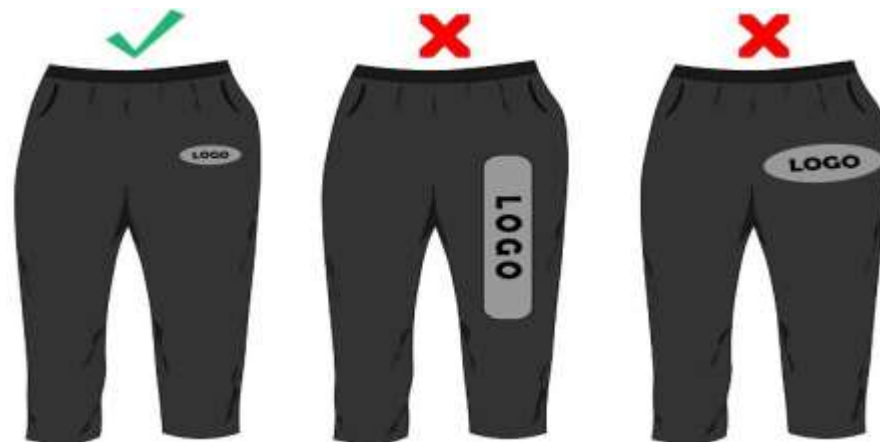
Figure 4.5. Pants.

4.1.6. Pants. Running pants must be solid black in color and may have one small visible trademark logo. The pants may not have multiple colors or patterns. See Figure 4.5.