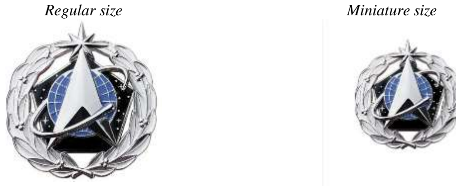
Table 3.3. Headquarters Space Force Staff Identification Badge.

3.1.12.3. Order of Precedence. The Headquarters Space Force Staff Identification Badge is subordinate to the Presidential Service Badge, Vice-Presidential Service Badge, the Office of the Secretary of Defense Identification Badge, and the Joint Chiefs of Staff Badge. Sister-service staff badges are subordinate to the Space staff identification badge if worn together. If other badges are worn, it will be in order of precedence. Example: If two staff identification badges are worn, the most senior badge will be on the left, ½ inch below the bottom row of medals. The next badge will be on the wearer’s right, ½” below the Lapel Insignia.