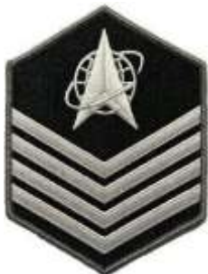
Figure 3.2. Enlisted Rank Insignia-Service and Mess Dress rank insignia.

3.1.3. Enlisted Rank Insignia. Guardians are encouraged to wear Space Force rank insignia upon availability from AAFES, MCSS, or Individual Issue. Configuration guidance remains unchanged and may be found in DAFI 36-2903. A USSF rank chart is available on myFSS: https://myfss.us.af.mil/USAFCommunity/s/knowledge_detail?pid=kA0t0000000oNHxCAM See Figure 3.2.