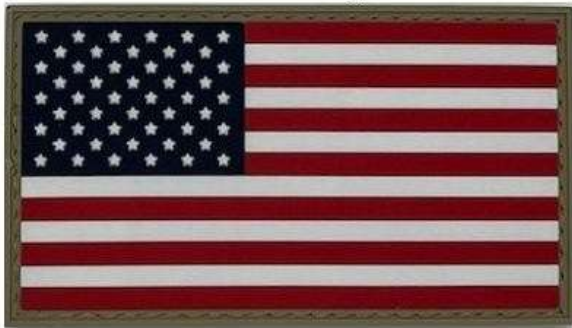
PVC American Flag