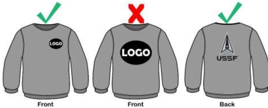
Figure 4.3. Sweatshirt.

4.1.5. Shorts. Shorts must be solid black in color and may have one small visible trademark logo. The shorts may not have multiple colors or patterns. See Figure 4.4.