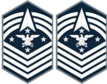
Figure 3.3. USSF SEAC Chevrons.

3.1.5. Service Coat Buttons. Guardians are encouraged to replace the Air Force Service coat buttons with the Space Force buttons upon availability from AAFES, MCSS, or Individual Issue. Service Coat buttons are not interchangeable with Mess Dress buttons due to size difference. See Figure 3.4.