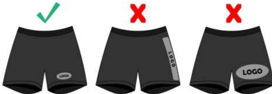
Figure 4.4. Shorts.

4.1.6. Pants. Running pants must be solid black in color and may have one small visible trademark logo. The pants may not have multiple colors or patterns. See Figure 4.5.